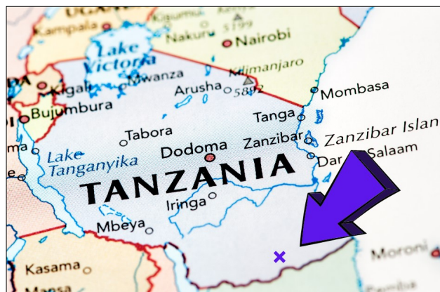
Location of Mother of the Savior in Nakapanya

Four teachers and assistants educate approximately 25 students.