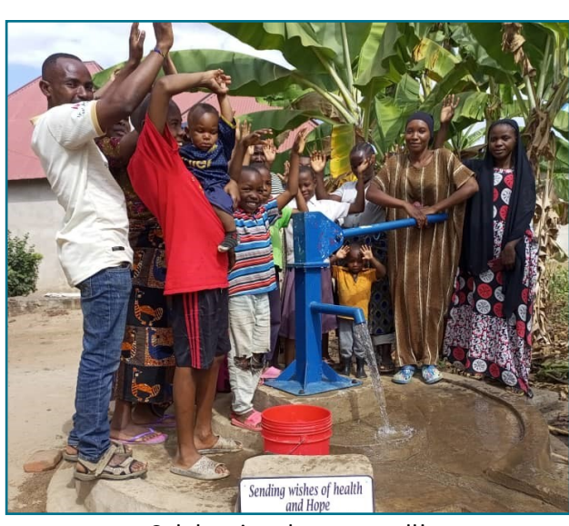
Celebrating the new well!