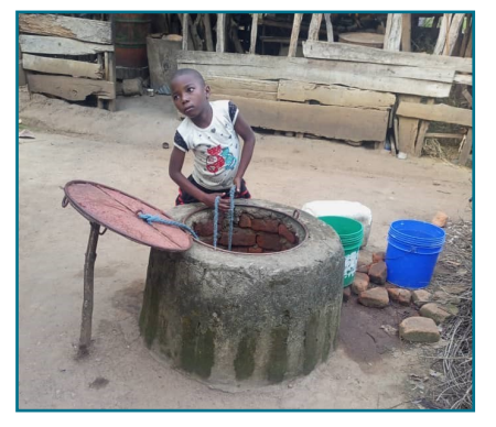
One of the previous sources of water