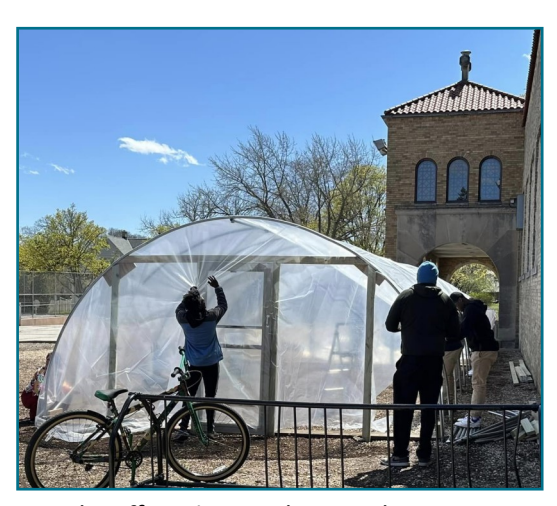
Students and staff setting up the Kingdom Prep greenhouse

We're looking for some help to clear the church and school entrances when snow arrives before our service can get to us. If you are interested or know of someone, please have them contact me!