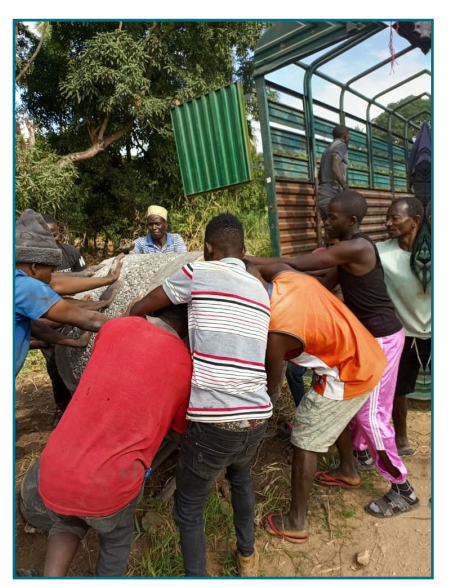
Unloading the well parts